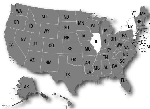
2004 Presidential Campaign Contributions